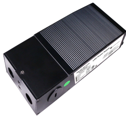
96W HARDWIRE DRIVER DVR-HWB-CV-24VDC-96W