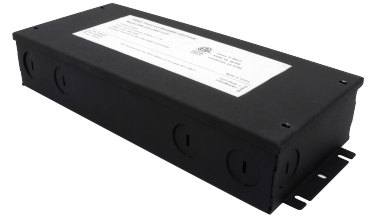
200W HARDWIRE DRIVER DVR-HWB-CV-24VDC-200W