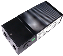
40W HARDWIRE DRIVER DVR-HWB-CV-24VDC-40W